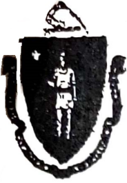
Mitt Romney Governor